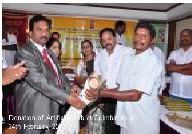
Donation of Artificial limb at Coimbatore on 24th February, 2013