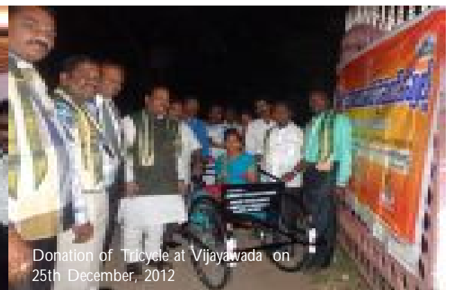
Donation of Tricycle at Vijayawada on 25th December, 2012