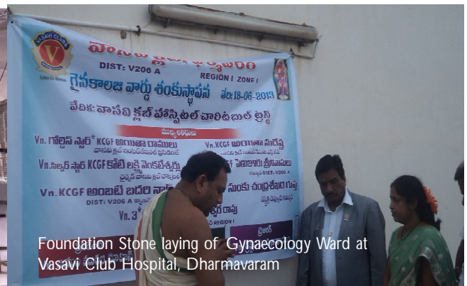
Foundation Stone laying of Gynaecology Ward at Vasavi Club Hospital, Dharmavaram