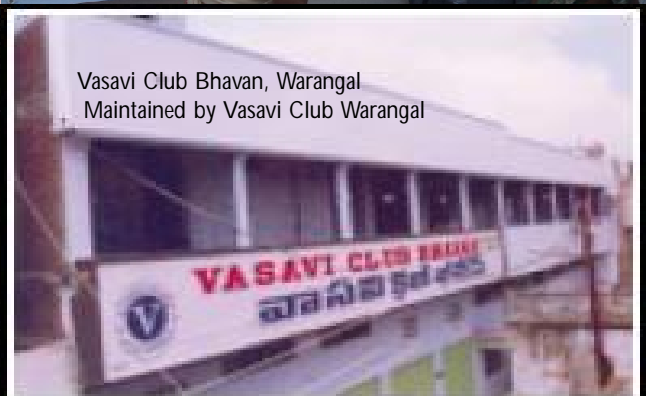
Vasavi Club Bhavan, Warangal Maintained by Vasavi Club Warangal