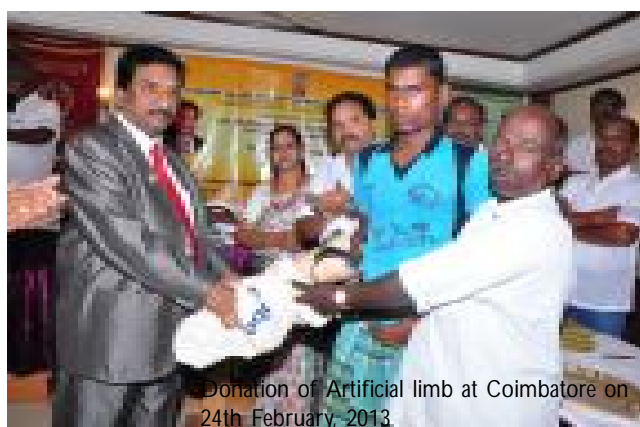
Donation of Artificial limb at Coimbatore on 24th February, 2013