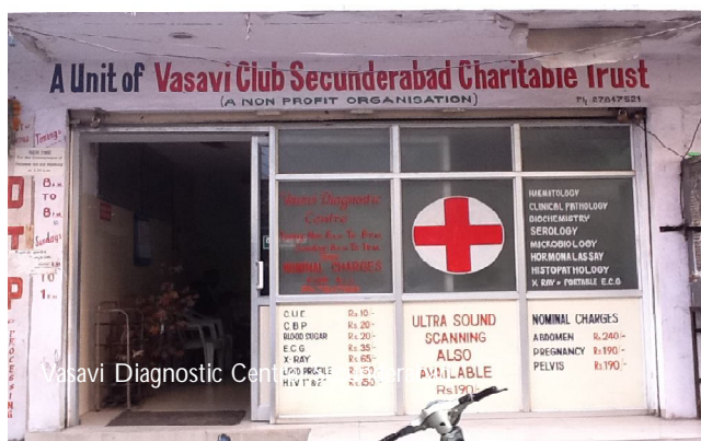
Vasavi Diagnostic Centre, Secunderabad

Book -Banks for Physically challenged and economically weaker students : 50 Book Banks with total books of over 6,235 sets of books from Intermediate level to Post Graduation level are provided freely to economically backward and Physically challenged students. The Books will be provided for the total period of course i.e. 3 to 5 years for each student. These Book Banks are established at various Districts in Andhra Pradesh, Karnataka and Tamilnadu.