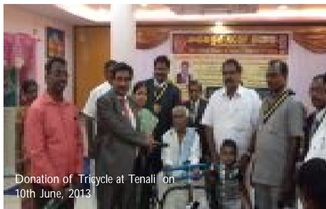
Donation of Tricycle at Tenali on 10th June, 2013