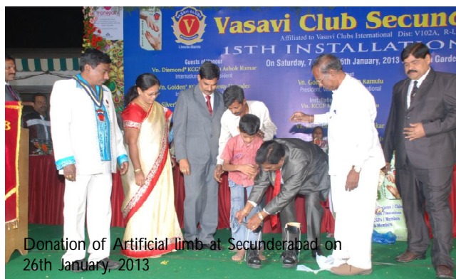
Donation of Artificial limb at Secunderabad on 26th January, 2013

All the services are provided within their community and is based on the assumption that the persons with disabilities are part and parcel of the community and every service provided to them will have to be provided to them within their own community. This principle is our institutional value and being promoted as a community based rehabilitation initiative.