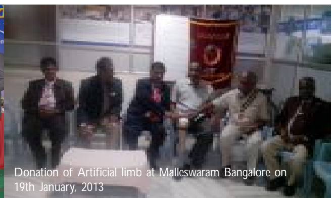
Donation of Artificial limb at Malleswaram Bangalore on 19th January, 2013