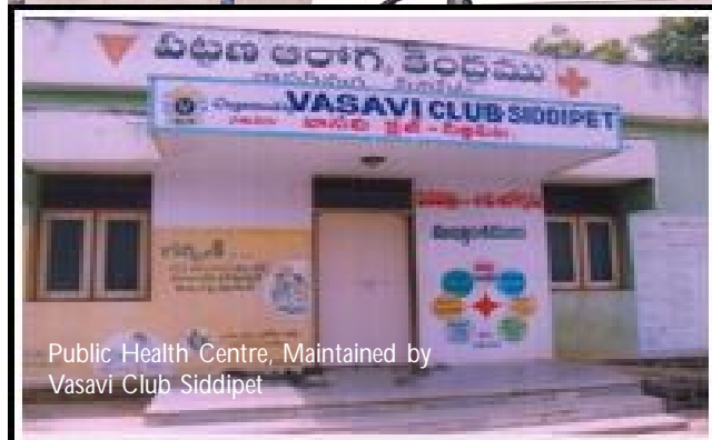
Public Health Centre, Maintained by Vasavi Club Siddipet