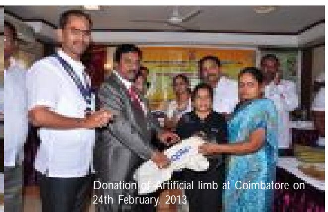
Donation of Artificial limb at Coimbatore on 24th February, 2013